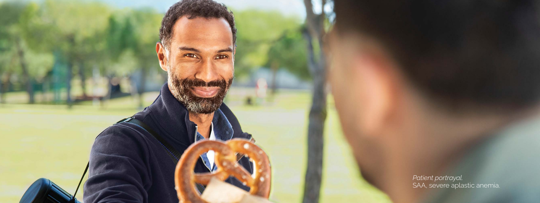
Patient portrayal. SAA, severe aplastic anemia.