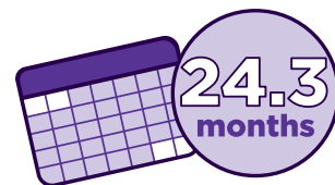
Median duration of response

If you are being prescribed PROMACTA, you should tell your doctor if you: